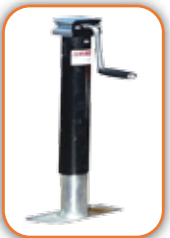
Drop Leg Hitch