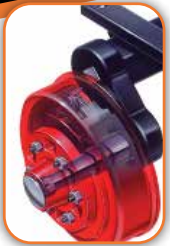
Rubber Torsion Axles